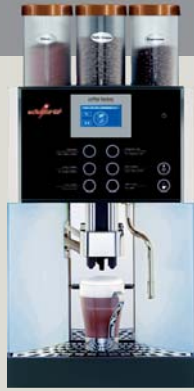
The Fresh Milk Family

Creamy cappuccino and delicious latte macchiato beverages at the press of a button. One model allows you to store the milk in a milk cooler inside the machine where it can be efficiently kept cool according to the strictest hygienic standards. An additional refrigerator can be placed beside the unit if you need larger supplies of fresh milk. The standard machine is equipped with 2 grinders. The 500 g or 1,000 g bean containers are easy to refill, disassemble and clean.