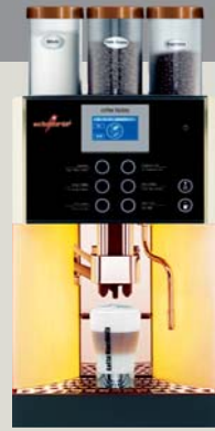
The Milk Powder Family

This version is ideally suited to an office environment, as a self-service option or wherever the milk powder option is preferred. Milk powder and cocoa powder can also be combined using the handy twin-container attachment.